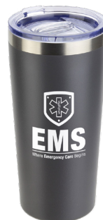
SENSO™ VACUUM INSULATED STAINLESS TUMBLER - EMS308