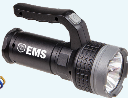
NEW! RECHARGEABLE COB WORK LIGHT + LED FLASHLIGHT - EMS28 $14.99