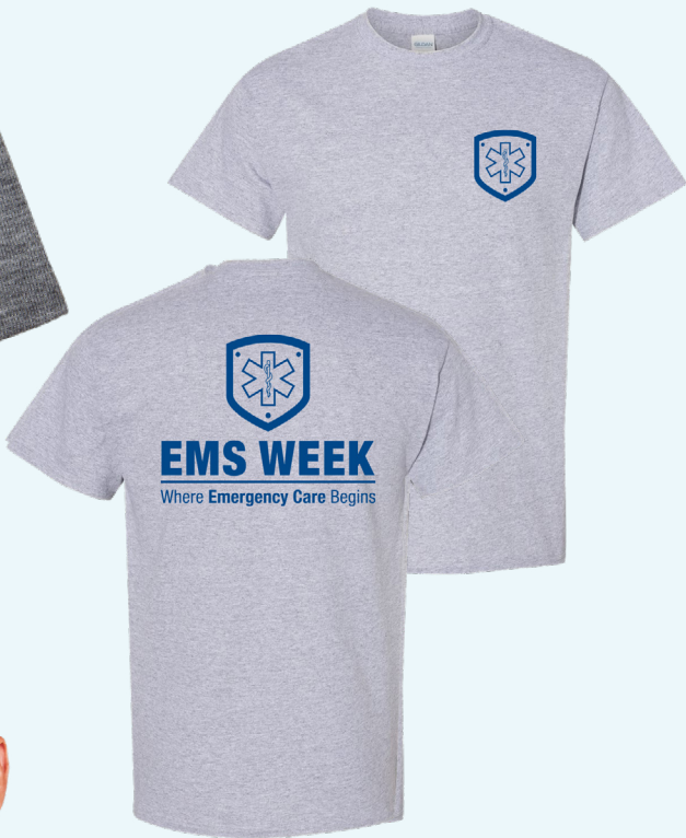
NEW! UNISEX DUAL PRINT T-SHIRT - EMS08 $14.99