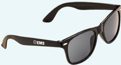
NEW! UV400 SUNGLASSES - EMS29 $4.49