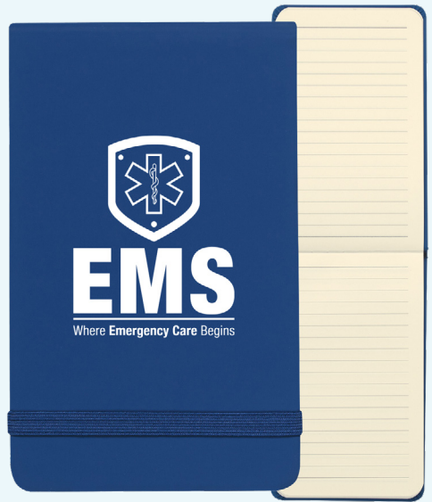
NEW! JOTTER NOTEBOOK - EMS24 $3.99