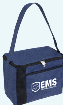
TOP SELLER! GREYSTONE COOLER BAG - EMS11 $9.99