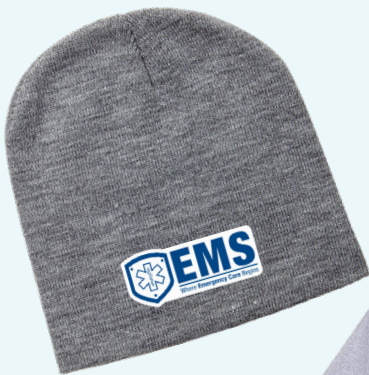
NEW! KNIT BEANIE - EMS10 $7.99