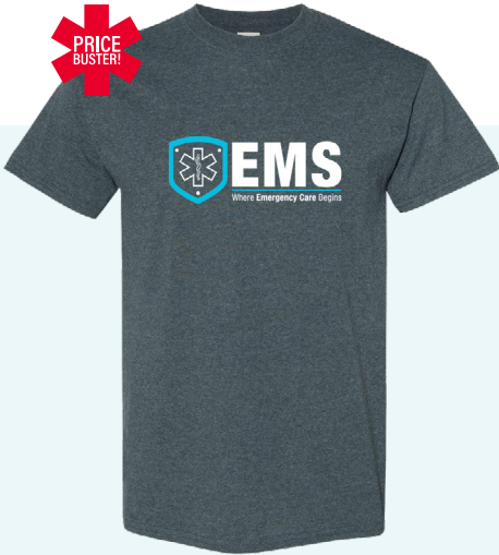
UNISEX T-SHIRT - EMS07 $9.99