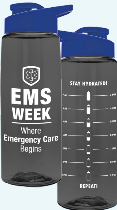
NEW! STAY HYDRATED BOTTLE - EMS21 $8.99