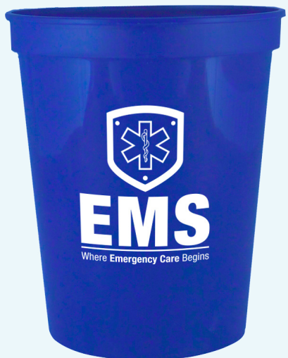
STADIUM CUP - EMS17 $1.15