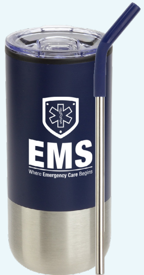
NEW! DUAL FUNCTION TUMBLER - EMS19 $12.99