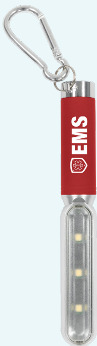
NEW! COB SAFETY LIGHT w/ CARABINER - EMS31 $7.99