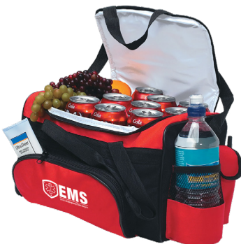
JUMBO COOLER - EMS301