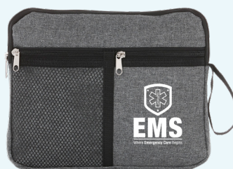
TOP SELLER! MULTI-PURPOSE CARRYALL - EMS13 $6.99