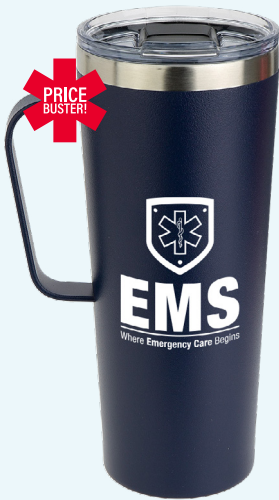
NEW! 28 OZ. VACUUM INSULATED MUG - EMS18 $24.99