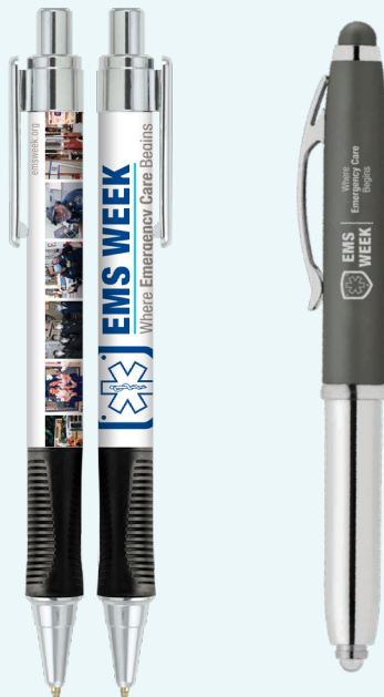
TOP SELLER! GRIP PEN - EMS22 $1.69