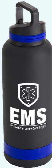
TOP SELLER! 25 OZ. VACUUM INSULATED BOTTLE - EMS20 $19.99