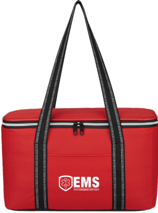
BRING-IT-ALL COOLER - EMS300