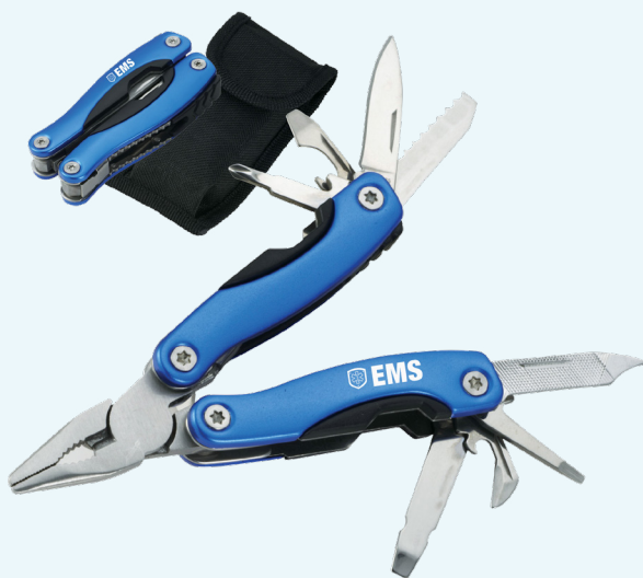
TOP SELLER! MICRO MULTI-TOOL - EMS26 $15.99