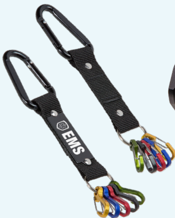
TOP SELLER! CARABINER STRAP W/COLOR CODE KEY CLIPS - EMS27 $4.25