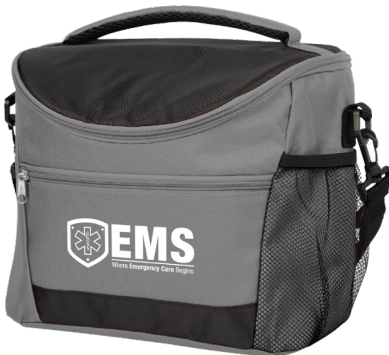
TAKE IT-TO GO COOLER - EMS303