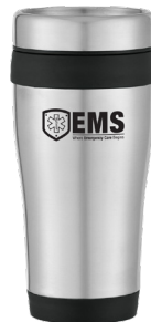
VALUE TUMBLER - EMS305