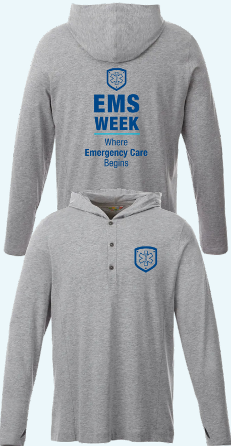
NEW! SPECIAL PRICING KNIT HOODY - EMS09 $49.99