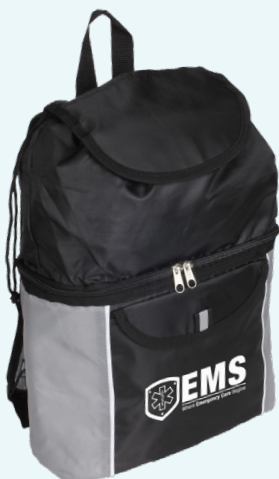
NEW! COOLER BACKPACK - EMS12 $16.99