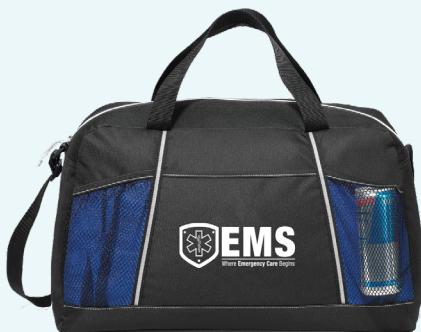
NEW! SPORT BAG - EMS16 $19.99