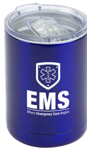
DUAL FUNCTION TUMBLER/CAN COOLER - EMS310