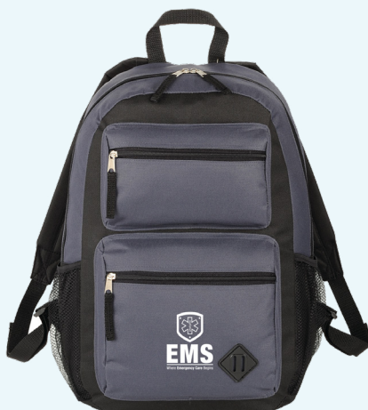
TOP SELLER! DOUBLE POCKET BACKPACK - EMS14 $19.99