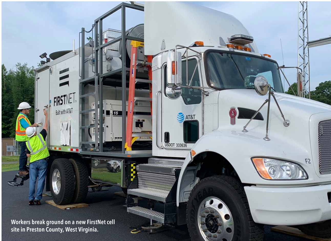
Workers break ground on a new FirstNet cell site in Preston County, West Virginia.

The prioritized access plays an important role in emergency communications, as seen in Ford County, Kansas. In this small, rural community, one of the biggest threats is fires. Local fire personnel use drones to livestream footage from the fire back to mobile devices, allowing first responders to get a complete picture to get ahead of the blaze, reducing fire damage and response time.